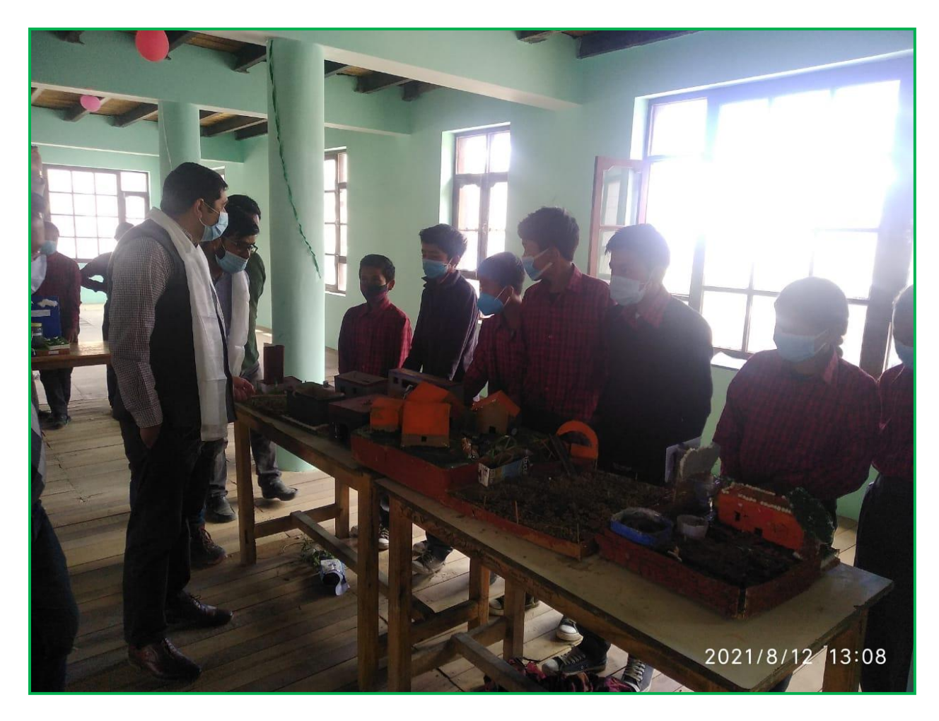
(Students showing their projects to SDM)