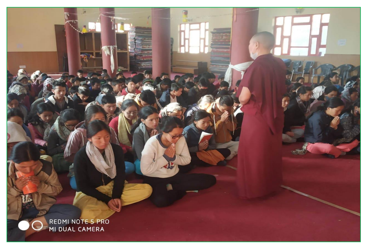
(Prayers reciting time)