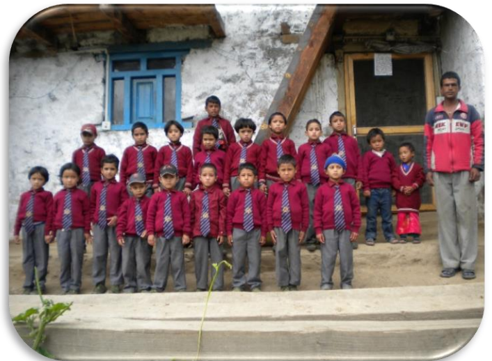
The first class, 10 years ago – now they are taking diploma courses!

Cost for one year: $18,700 (for the hostel, schooling for 15 students, outreach to the students now back with their families, and income generation schemes for parents)