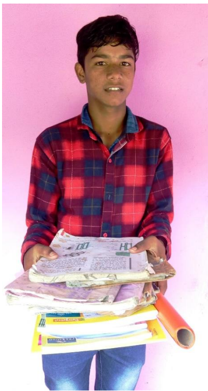
New school supplies for studying at a VOC Education Centre