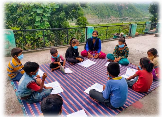
Learning to read