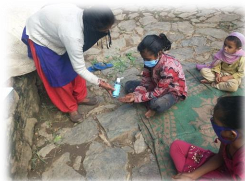
Hand sanitizer is the norm for these children