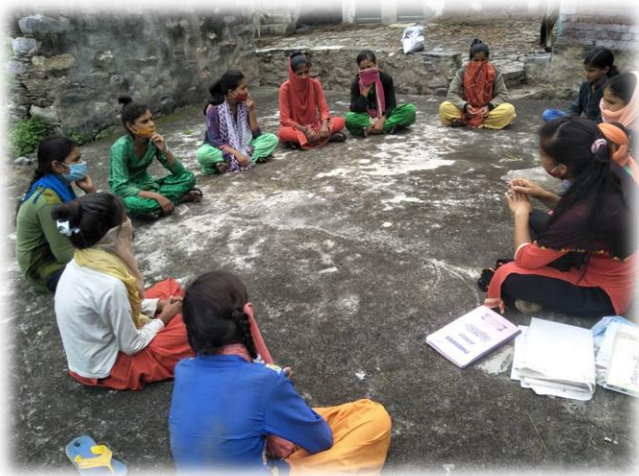
Keeping up their studies