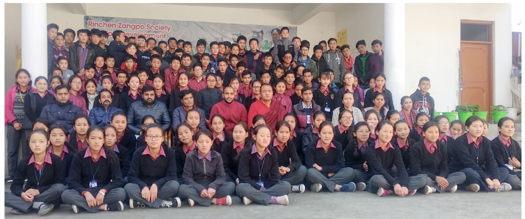
Students, staff and our precious teachers at Sidhbari Hostel during the winter session of classes.

The 8th, 9th and 10th classes from Munsel-ling School in Spiti left our home valley and shifted to our hostel at Sidhbari on winter migration in December as usual. At Sidhbari they experience the outside world and get extra tuition from skilled