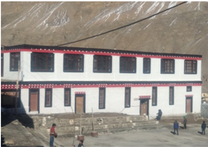
New examination hall at Munsel-ling.

Examination Hall: On top of the cultural hall there is now a newly finished and very spacious examination hall. Three hundred children can sit and take exams together! Funds to build this fine and useful addition to our infrastructure came from local government.