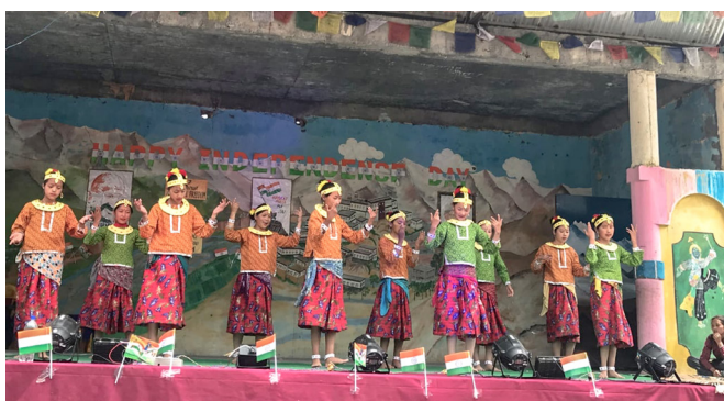
Indian Independence Day with traditional dancing at Munsel-ling.