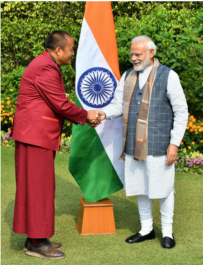
A community leader meets a nation's leader: Ven. Tashi Namgyal is congratulated by Indian Prime Minister Narendra Modi.

The event was telecast on national channels and shared widely on social media including tweets from the Prime Minister. All Rinchen Zangpo Society supporters can feel very pleased. It is always satisfying to back a winning horse!