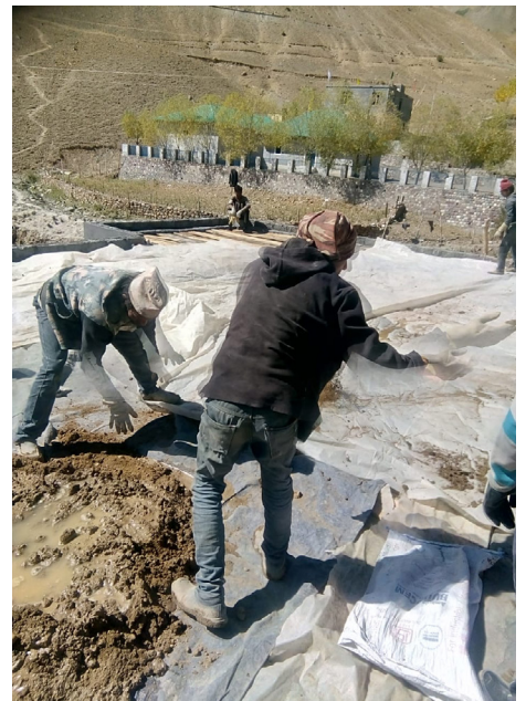
Workers applying a weatherproof layer to earthen roofs.

Classroom roofs, hostel roofs, staff quarters roofs all started leaking badly. The best solution found so far is to scrape off a layer of mud from the roof, lay down a sheet of waterproof plastic that is sufficiently strong and thick and then replace