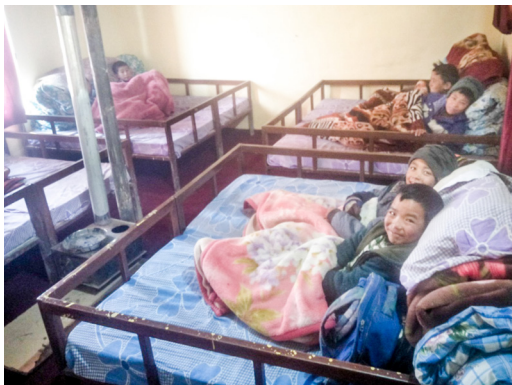
A warm and cozy night's sleep, courtesy of the Swiss government.

Roof Renovation: From 23rd September 2018 four days of very heavy rain hit Spiti. Traditional Spiti house roofs are flat and made of mud and earth laid over a wooden support of rafters, beams, then twigs or strips of wood. This is an ideal roof for a desert climate. Snow that falls in winter can be brushed off before it melts. Heavy rain is a serious threat.