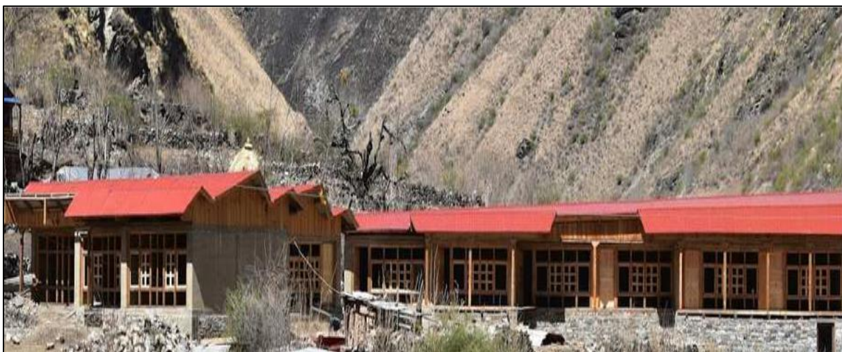
READI's school nears completion

The hostel has now closed and the READI group is concentrating on the new school they are building outside the capital, Simikot. They will be in touch with TRAS by the end of the year to share their plans, be it taking in students one year at a time or starting technical training courses (there are currently none in Humla). Whatever they decide is best for their remote mountain community, it will be an exciting venture, based on sound experience! We hope to be able to help in some small way.