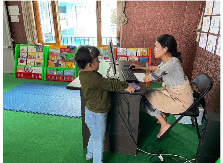
Proudly borrowing books

Voice of Children Remote Libraries: VOC has requested more libraries. The first 20 small village libraries created a few years ago have been highly successful, and even more remote villages have been requesting the same benefit. Hundreds of children enjoy the experience of borrowing and reading books, their parents are using the libraries too and they have become meeting places in the villages. Some of the original libraries amalgamated, leaving 12 thriving, but requesting more books and periodicals and for the well-worn floor matting to be replaced. Dr. Yosef Wosk, lover of libraries, supported the original libraries and now the Yosef Wosk Family Foundation (YWFF) is kindly supplying fresh matting and new books for those 12 and the start-up money to open five new libraries around Nainital and five around Almora. ( Cost: $8,922 )