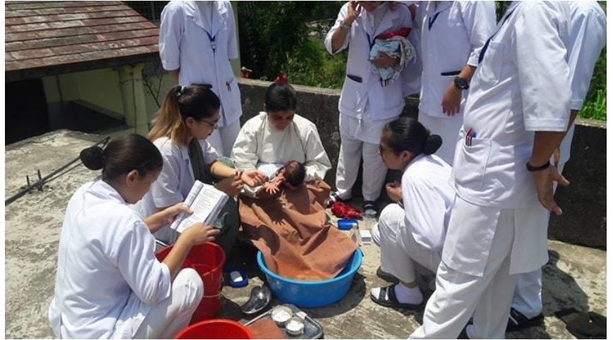
Midwife trainees bathe a baby

midwifery course in Pokhara, Nepal, is in a state of flux. Although IDEA has been doing an exemplary job training midwives in a country that desperately needs them, the government has pulled the rug from under their feet and discontinued all 18-month midwifery trainings except in institutes running their own 100 bed hospital (IDEA had always had the students work in local hospitals - a satisfactory arrangement). Over the years IDEA has trained 1,000 midwives and now must change course.