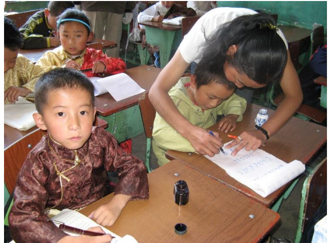
Lhasa Yuthok Kindergarten

Sadly, the one place we have not been able to help for several years now is Tibet itself. Having funded a day care centre, a health post, traditional medical training courses, an English school and a kindergarten in Lhasa, an old people's home and sewing training for nuns, TRAS was about to fund training in pediatric cataract surgery when the Chinese government put a stop to all foreign aid to Tibet.