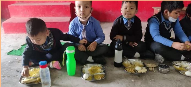
The supplementary diet: one helping of meat and one egg per week and a few fresh veggies and fruit. A meager diet indeed without these extras.

Supporting health and education for children and youth in the Himalayas