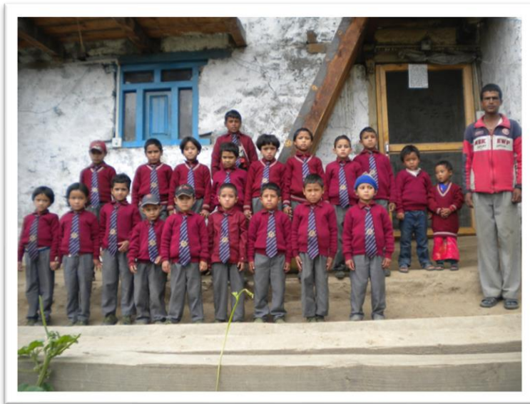
Day 1 at the READI hostel - now they are going to technical schools!

READI Nepal reached a milestone in April, when the last nine children in the hostel took their school leaving exams. If the past few years are any indication, the READI students will score very high. They have exciting plans to go on to technical schools in neighbouring districts.