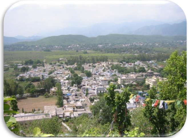
Dekyiling Tibetan Settlement – same view then and now

Agriculture, forestry, construction, sanitation, drinking water, dairy farming, health care and vocational training were all supported by TRAS, with the work being done by the Tibetan government in exile and by local NGOs. Large grants were sought from the BC Fund for Agricultural Aid and the Canadian International Development Agency, and until CIDA changed its policy to helping only projects over $100,000, no application from TRAS was ever turned down.