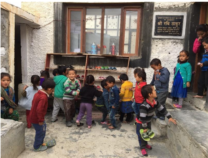
Putting on their shoes at Munsel-ling School

The children live in a variety of situations. The Tibetan Homes Foundation (THF) and the Tibetan Children's Villages (TCV) were set up in the 1960s at the request of the Dalai Lama to look after the many children whose parents had either died on the arduous journey to India or had stayed in Tibet while sending their children on that long trek to give them a better chance. Nowadays the THF and TCV take in the neediest children from the Tibetan settlements in India and Nepal. The Tibetan Women's Centre in Rajpur, the Dekyiling Tibetan Handicraft Centre and Chauntra Settlement were set up as weaving centres in the 1960s to keep alive Tibetan crafts and to house and employ the hundreds of refugees pouring in from Tibet since the 1960s and from Bhutan in the 1980s. Today, alongside the weaving, most other regular sources of income, such as "petty business" and selling sweaters all over India in the colder months, are precarious. It is also sadly common for one or both parents to have TB and be unable to work. TRAS helps out by sponsoring the children of the families with the greatest financial needs. And in the distant Spiti Valley, the Munsel-ling School was founded by a Tibetan monk determined to give the local tribal children the education which the government did not provide.