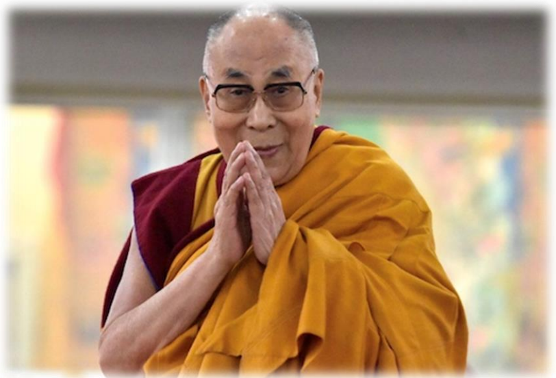
His Holiness the Dalai Lama