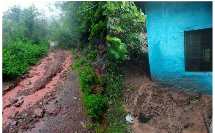
Heavy damage caused to the road and households in Bonshi Tibetan settlement in Himachal

(Some good news: TRAS recently paid for the sturdy roofs which now cover the traditional mud roofs on the Munsel-ling School (HP) buildings and in spite of the heavy rains, they did not leak! And the School was able to play host to 300 tourists stranded by the floods.)