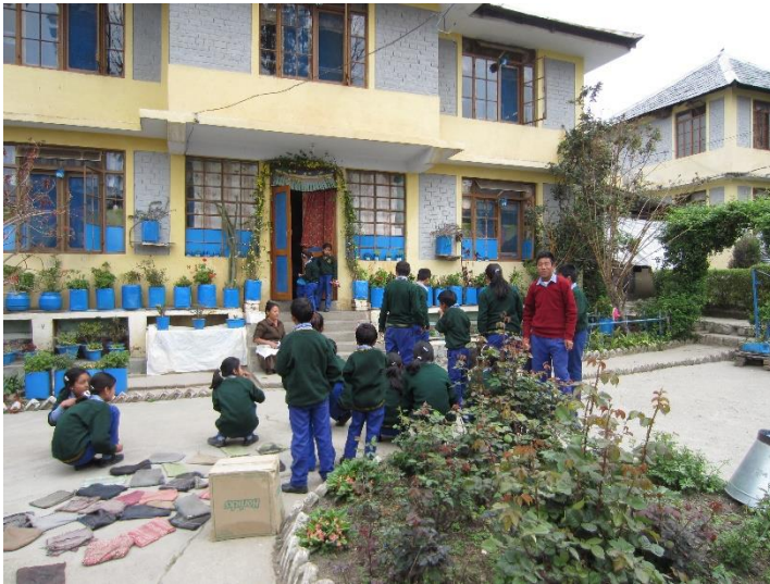
Snack time at TCV Suja

The people: Let's look at some of the settlements and the children who need our help.