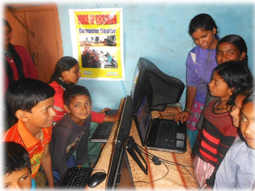
VOC computer class

The Central Tibetan Administration (CTA) Nurses Training is a steady success, with eight student nurses at various stages in their 3-year program paid for each year by TRAS. We have just heard that one of the new batch of students comes from the Tibetan settlement, Kollegal, south India, and two come from distant Choglamsar settlement, Ladakh!