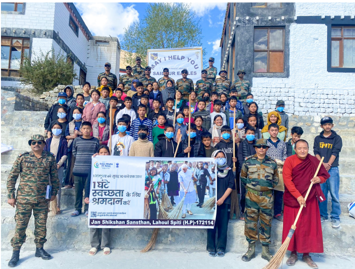
Working with the Indian Army to keep the community clean (above) with students taking care of local trees (right)