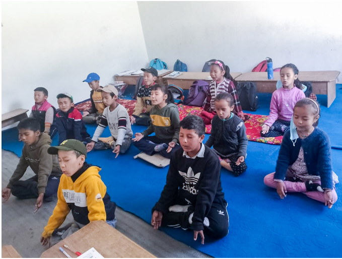
Meditation and prayer are a part of each student's daily practice