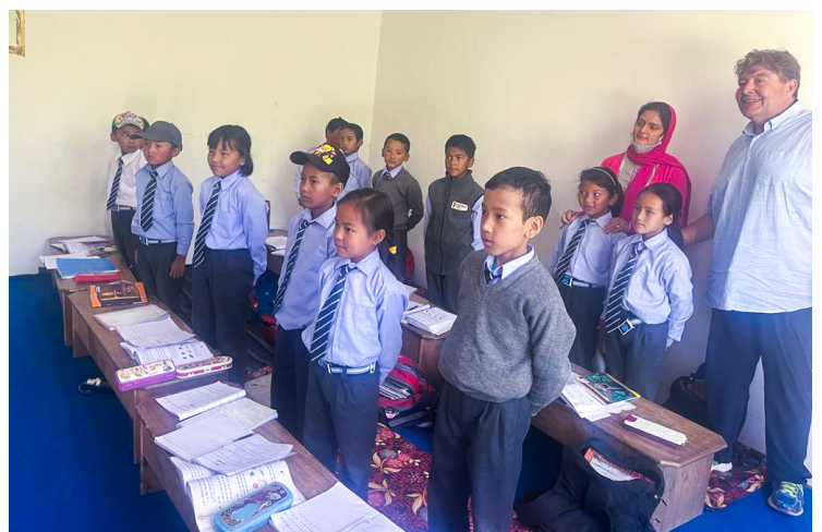
Fresh students getting off to a great start in a fresh school

The New Nalanda Pre & Primary School is the latest addition to the Rinchen Zangpo Society for Spiti Development's educational programme. The new school is in the village of Chango, Upper Kinnaur, about four hours' drive down the valley from Munsel-ling School and Kaza. It is by the Spiti river, not so far from where our river joins the Sutlej south flowing into India from Mount Kailash in Tibet. Here grow the finest apples, as our students and the greater community regularly enjoy.