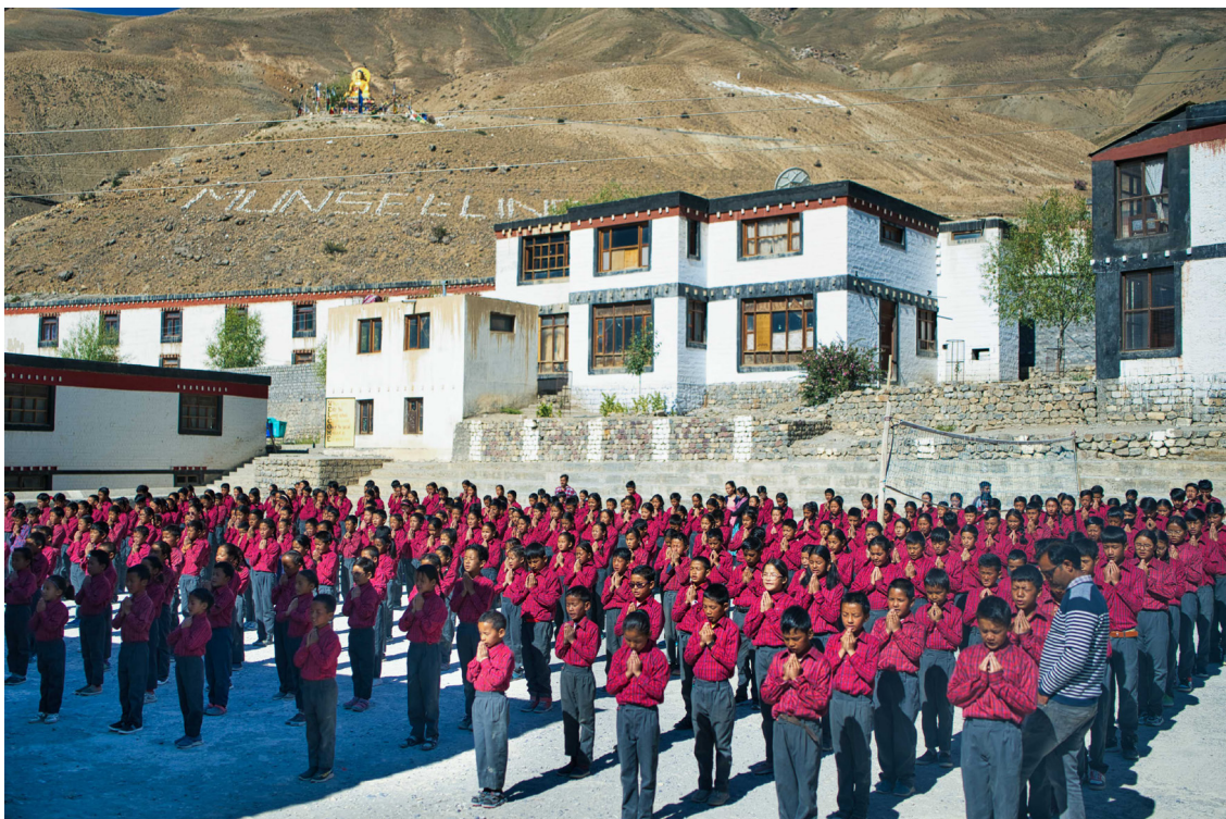
A bird's-eye-view of Munsel-ling campus (top) with students gathered for morning assembly (bottom)

https://youtu.be/sOYF2lmiwtU?si=kOGkeZ-4pmsNfHn