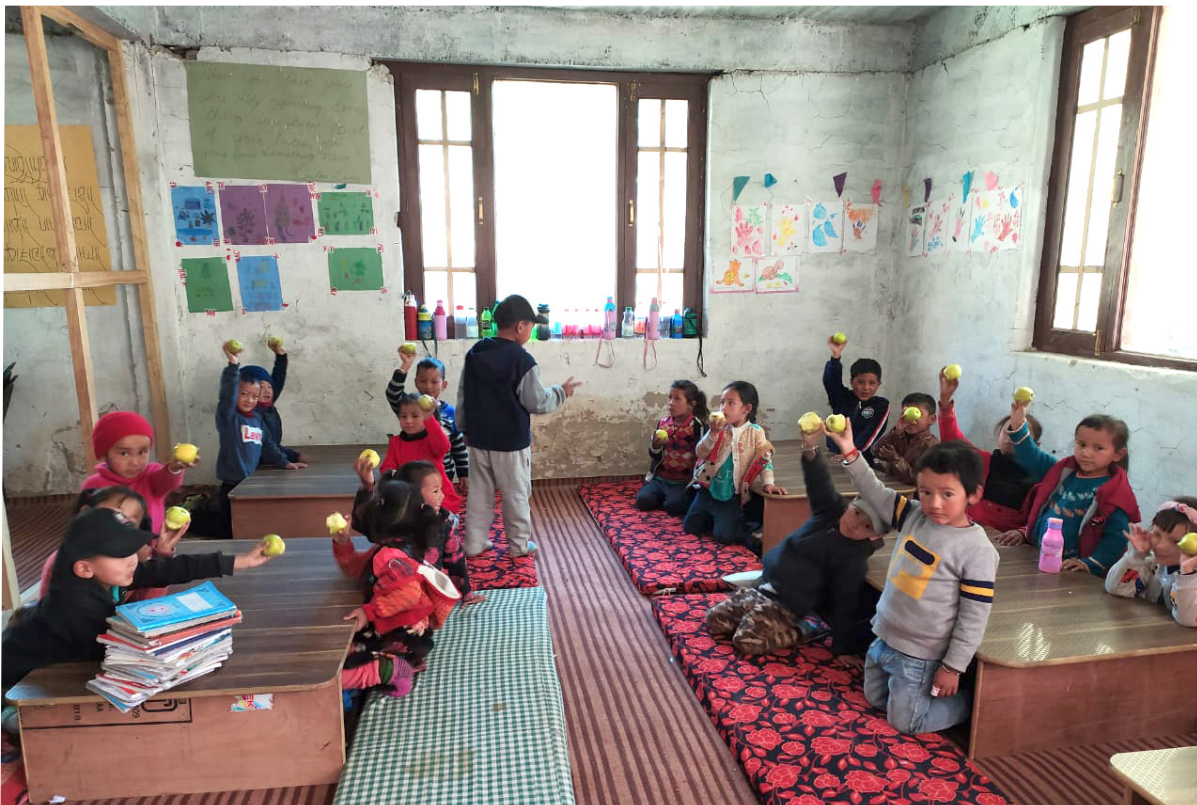
An apple a day keeps the doctor away! The students at our new school in Chango now receive a high-quality education, and might even themselves become the future physicians of their community

The New Nalanda Pre & Primary School is the latest addition to the Rinchen Zangpo Society for Spiti Development's educational programme. The new school is in the village of Chango, Upper Kinnaur, about four hours' drive down the valley from Munsel-ling School and Kaza. It is by the Spiti river, not so far from where our river joins the Sutlej south flowing into India from Mount Kailash in Tibet. Here grow the finest apples, as our students and the greater community regularly enjoy.