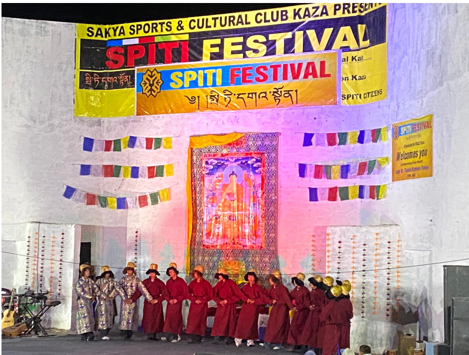
Munsel-ling students performing at the Spiti Festival

of Chicham on an alpine pastureland not far from there. After taking care of business in Ladarcha, the traders then moved onward to Kullu City and to Rampur where similar agricultural fairs were held. But in the 1960s, after the borders with Tibet were cordoned off by the Indian and Chinese armies, the Ladarcha Fair ceased in its original form, moved to Kaza and eventually became the Spiti Festival, the cultural celebration we have today.