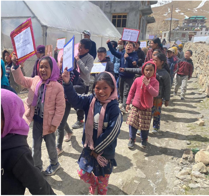
Young students exercising their democratic right to public protest in Kaza

The Central Board of Central Education is now the examining board for our schools. We gradually improved our school infrastructure and teacher qualifications and thus were recently able to meet their criteria for affiliation. Then our students this year, for the first time, had the challenge of taking their more exacting examinations. Happily, we had a 100% pass rate, 52 students in 10th grade, (age about 16) and 12 students in 12th grade (age about 18).