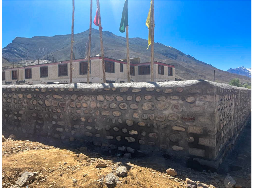
The new wall now in place at Rewa Primary School