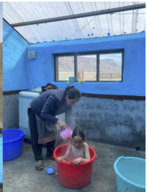
Translucent panelling on the roof at Rewa Primary School keeps the inside warm when the outside is freezing