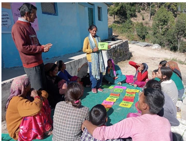
HFC Parents' Meeting