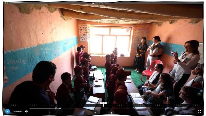
The condemned classroom

The season for building before the winter snows arrive and Zanskar is effectively cut off from the rest of the country is short, so it's all hands on deck to get the bulk of the building completed by October! Meanwhile, the nearby community hall has offered to house classes for the 170 children during construction.