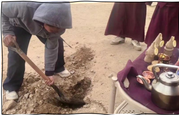
Ground breaking with traditional ceremony

Most importantly, the new roof will be metal, saving the new walls from damp and decay. The main donor is the Tibetan Children's Education Foundation in Montana, with whom TRAS worked successfully on education projects in Sikkim a few years ago. TRAS has agreed to send $6,000 to the project and also a further $2,500 to furnish a school library. After much discussion as to how much of the original structure can be saved, the plans are in place and the ground has been broken for the new wing.