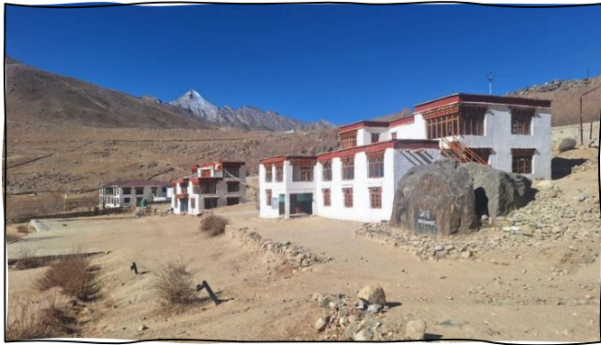
Jamyang-ling School: traditional Tibetan architecture

Jamyang-ling School in Zanskar, Ladakh , has been slowly crumbling over the past few years and finally funds are being raised to shore up the building, replace damaged classrooms and add a new wing.