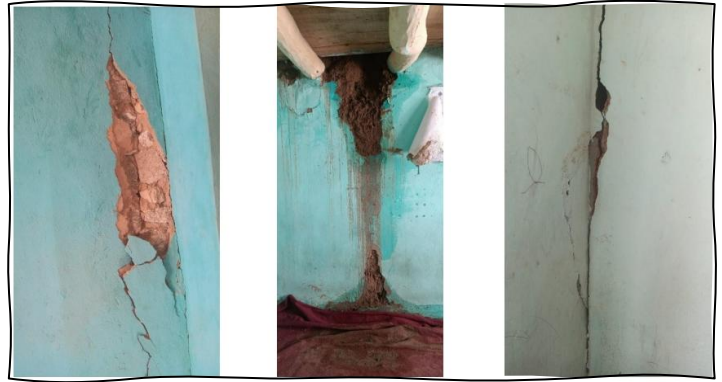
Cracks in the Jamyang-ling classroom walls

Most importantly, the new roof will be metal, saving the new walls from damp and decay. The main donor is the Tibetan Children's Education Foundation in Montana, with whom TRAS worked successfully on education projects in Sikkim a few years ago. TRAS has agreed to send $6,000 to the project and also a further $2,500 to furnish a school library. After much discussion as to how much of the original structure can be saved, the plans are in place and the ground has been broken for the new wing.